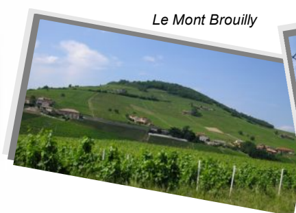
Le Mont Brouilly