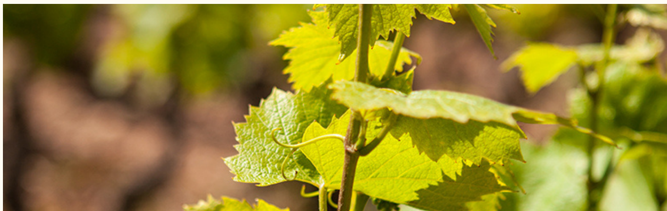
VINES, 21ST OF JUNE 2021