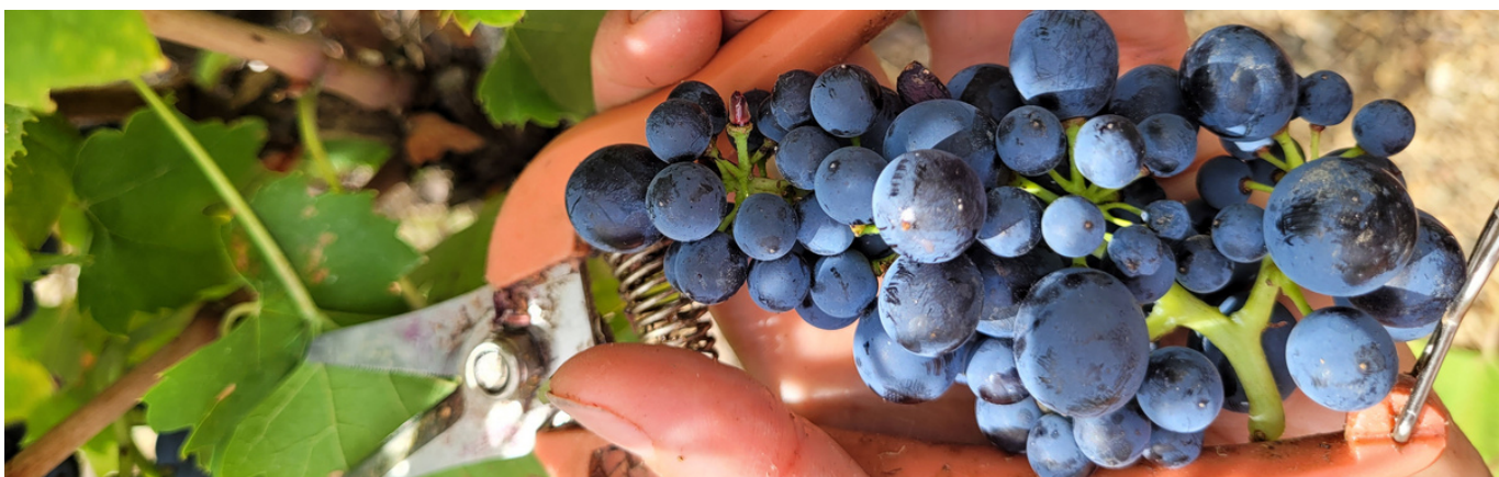
GAMAY NOIR GRAPE